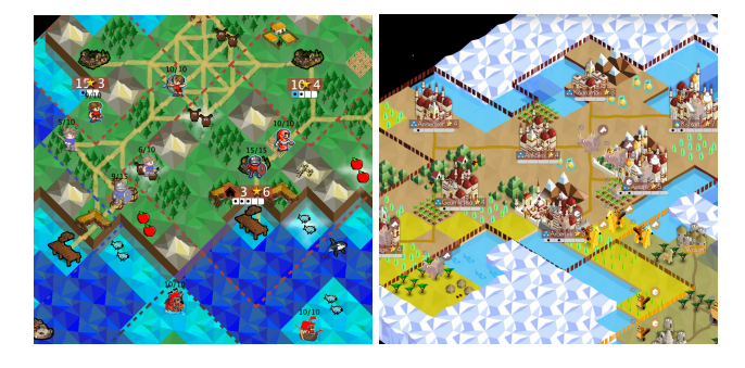
Figure 1: Tribes (left) and The Battle of Polytopia (right).

combat. Combining all of them requires effective decision making and enables different playing strategies. Managing the economy revolves around the accumulation of game currency (stars). These are produced by all the cities owned by the tribe and are awarded at the beginning of each turn. The collection of resources and construction of buildings adds population to cities, which then level up every time the population reaches a target (city level+1). Leveling up augments the star production of the city and provides bonuses to choose from (extra production, resources, city border growth, etc). If a city reaches level 5 or higher, a specially strong unit (a superunit, or Giant) can be spawned. Each tribe unlocks new features by spending stars to research up to 24 technologies in the tech tree, including the construction of new buildings, ability to gather new resources within the city borders or traverse water and mountain tiles.